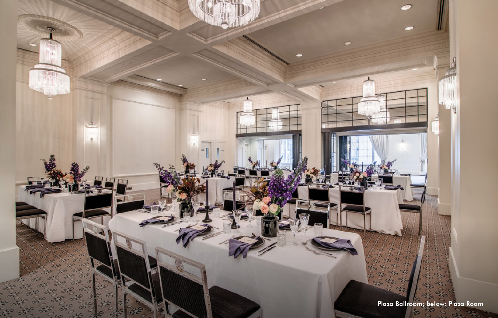
Plaza Ballroom; below: Plaza Room