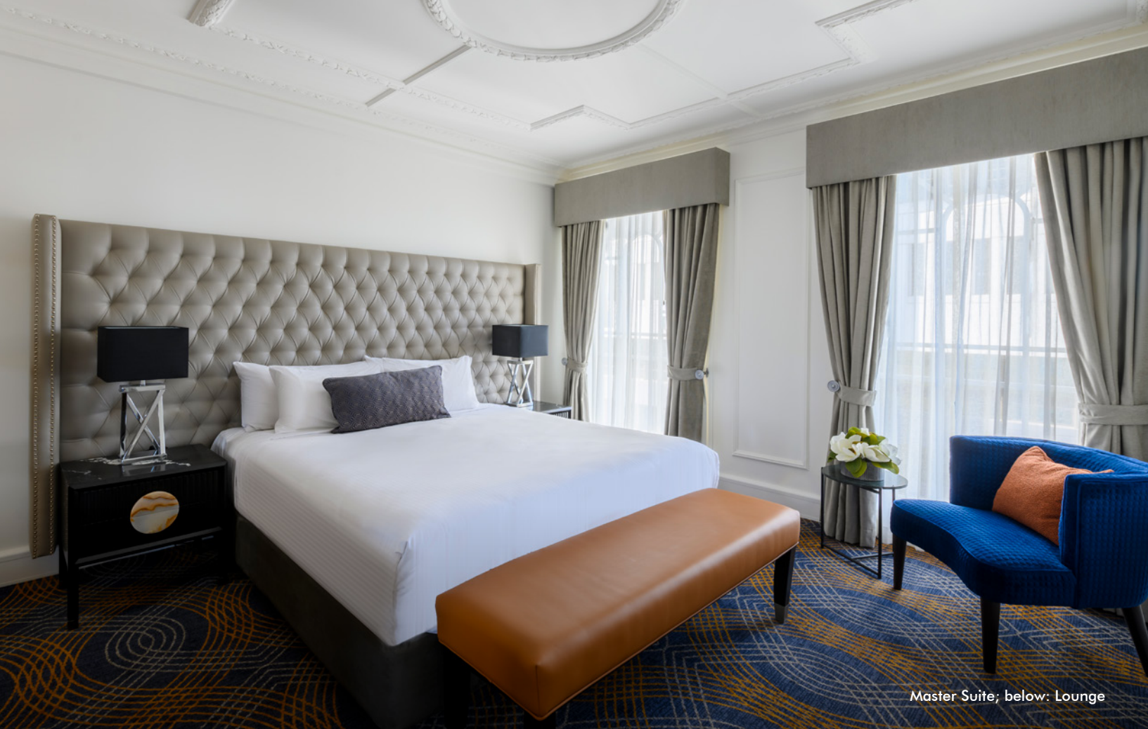
Master Suite; below: Lounge