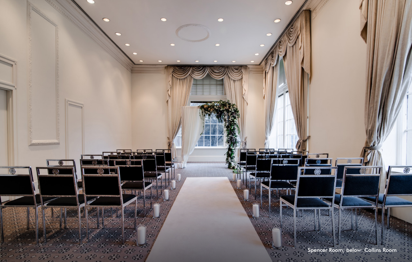
Spencer Room, below: Collins Room